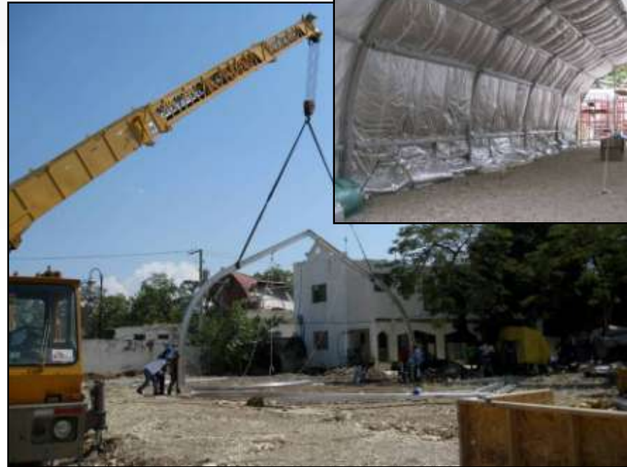
Administrative Base under construction for the Government of Haiti (April 2010).