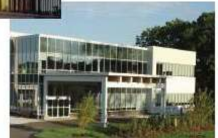
MODULAR COMMUNITY HEALTH FACILITIES