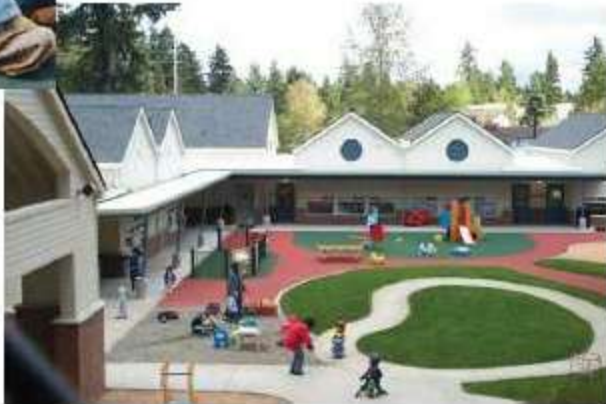
MODULAR CLASSROOMS + DAYCARES